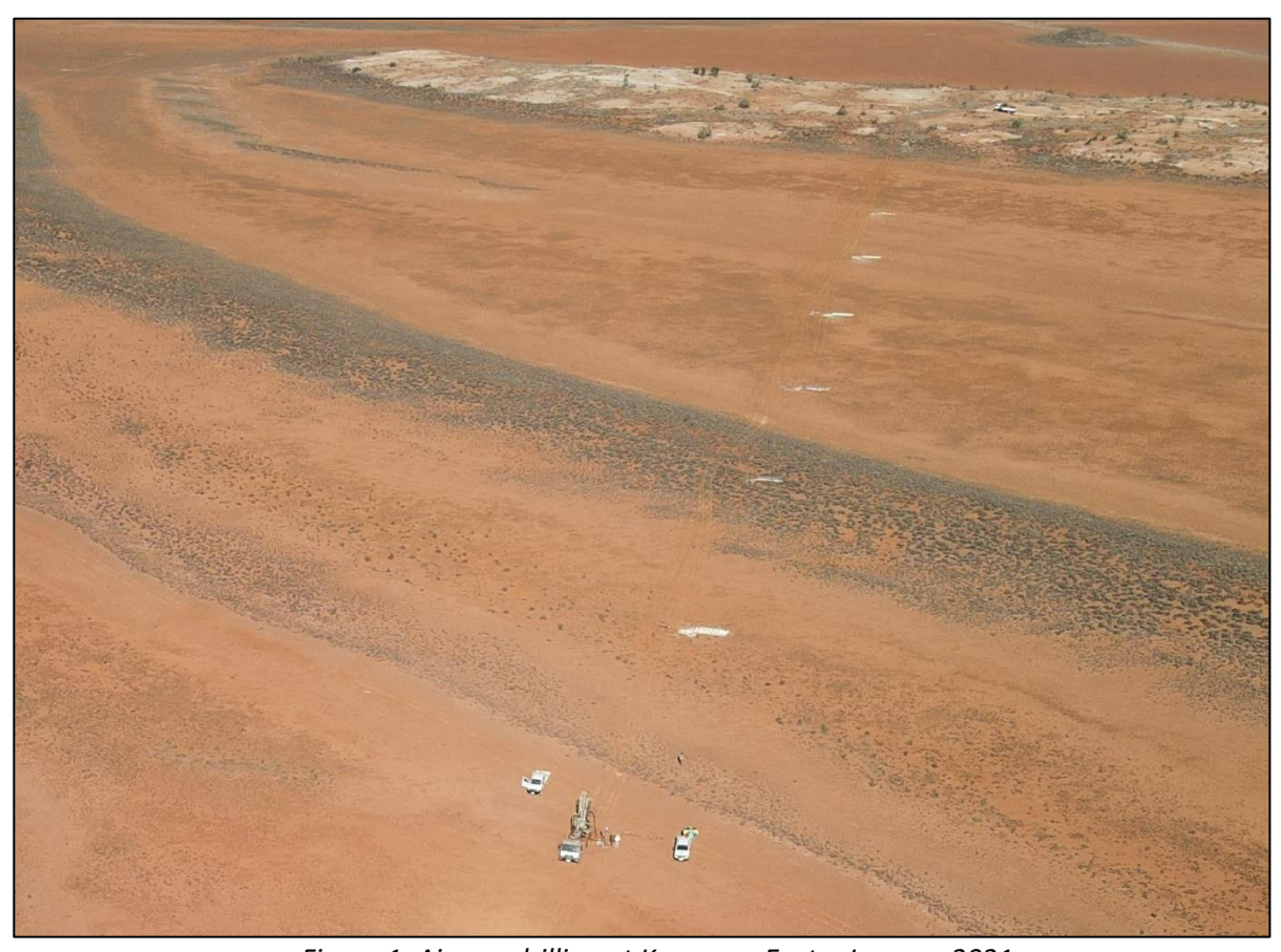
Figure 1. Aircore drilling at Kanowna East – January 2021

This stage-1 program of wide-spaced aircore drilling has been designed to test the bedrock geochemistry beneath the cover sequence of lake clays and sands. This will give Metal Hawk's geologists a better understanding of where the gold system could be at depth in order to develop targets for stage-2 exploration.