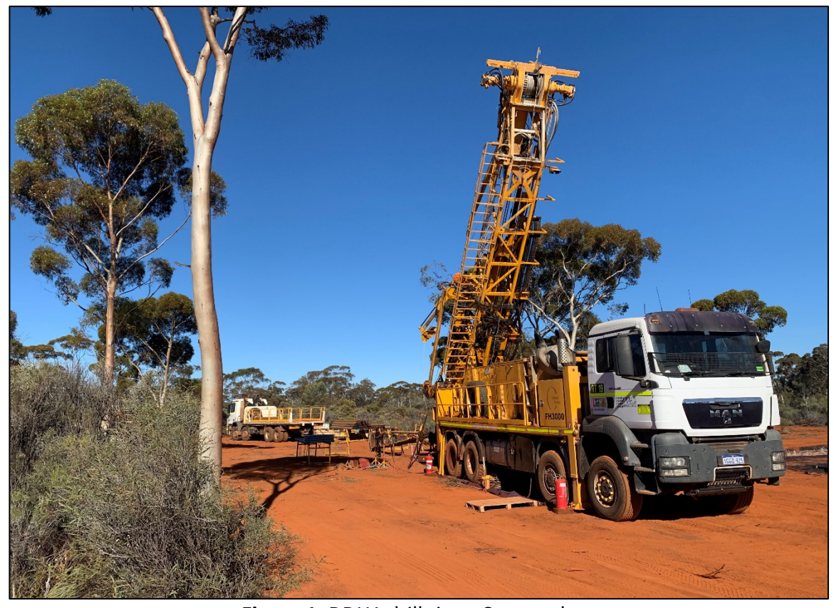
Figure 1. DDH1 drill rig at Commodore

Reverse Circulation (RC) drilling is also scheduled to recommence this week.