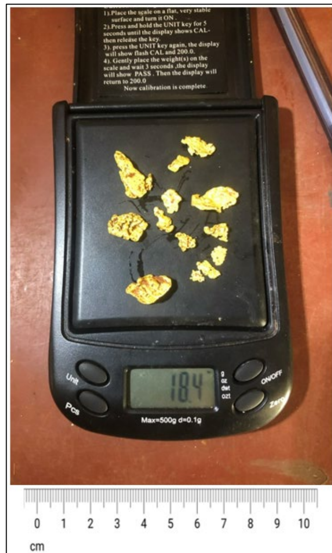
Figure 2. Alluvial gold recently recovered from tenement P25/2634