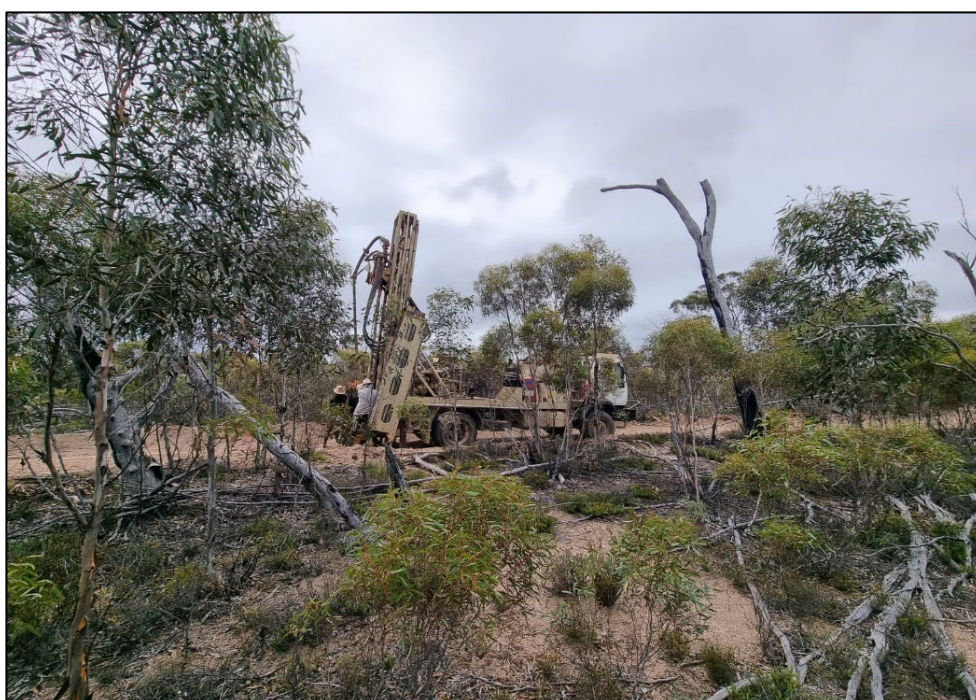
Figure 1. KTE aircore drill rig at Fraser South

The drilling is targeting rare earth element (REE) mineralisation and early-stage indicators of Ni-Cu-PGE mineralisation along the interpreted southern structural extension of the western margin of the Albany-Fraser belt.