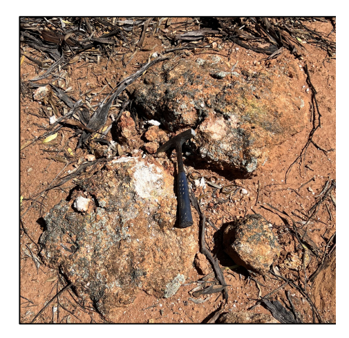
Figure 2. - MYP062 - highly weathered pegmatite grading 1,268ppm Li2O

A reverse circulation (RC) rig has been secured and will be mobilised to site to commence drilling in early December targeting fresh spodumene mineralisation.