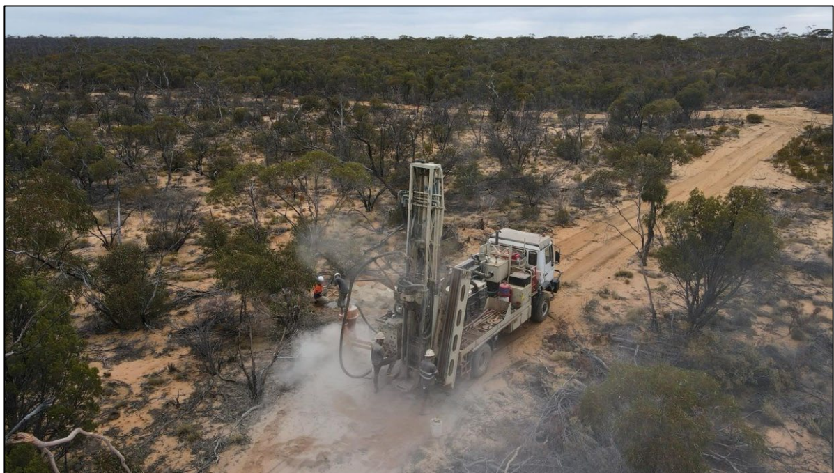
Figure 1. AC drilling at Yarmany – February 2024