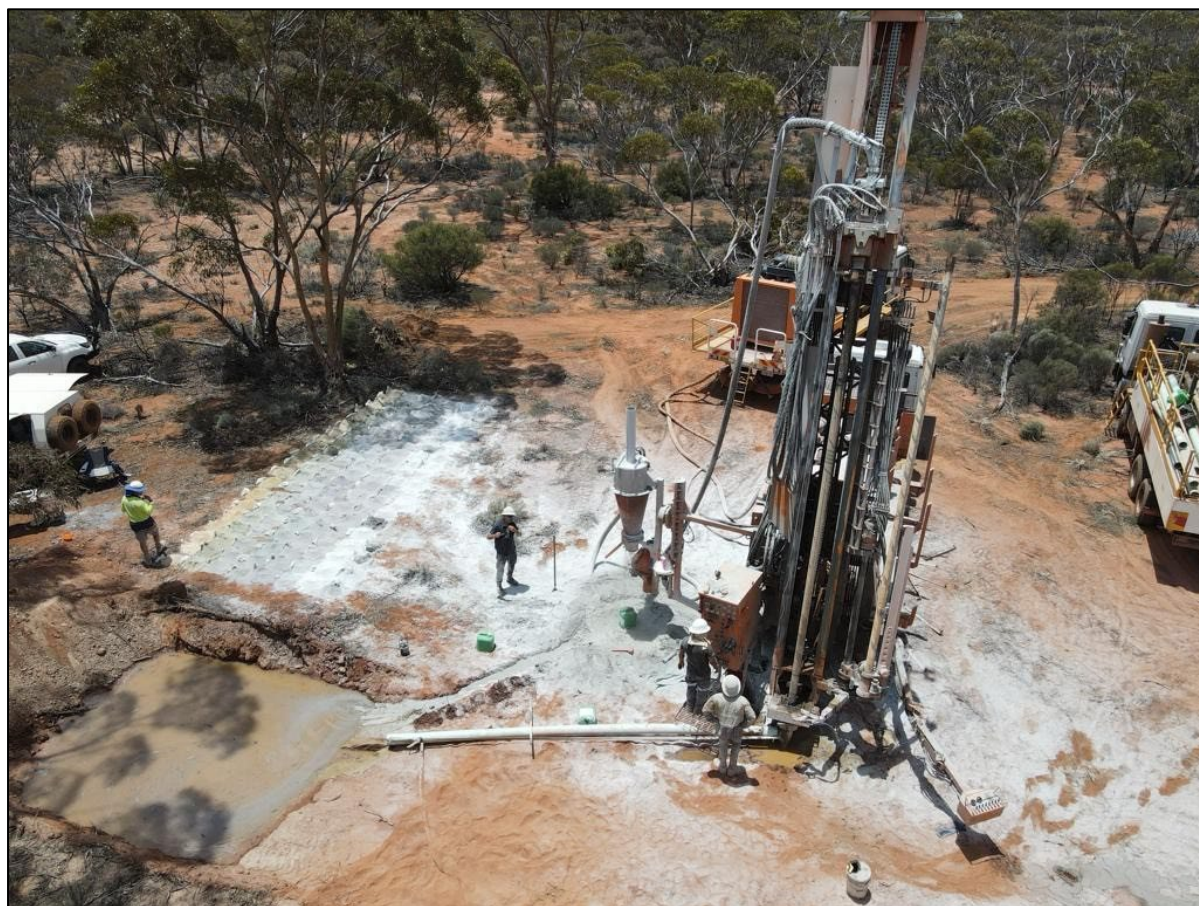
Figure 1. RC drilling at Yarmany – December 2023

An Aboriginal Heritage survey was completed in mid-December which will enable Metal Hawk to significantly ramp up regional exploration drilling at Yarmany in early 2024. The Company is planning to test a range of priority lithium and nickel sulphide VTEM targets proximal to the Ida Fault.