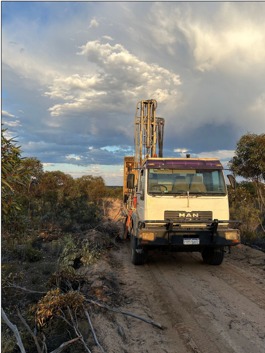
Figure 1. KTE aircore drill rig at Fraser South, September 2023