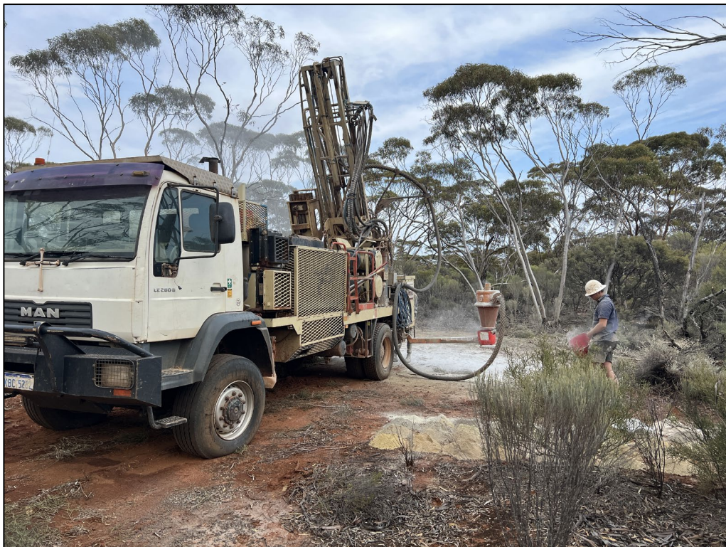
Figure 1. Aircore drilling at Yarmany – November 2023

Aboriginal Heritage surveys are planned for December and will focus on the southern portion of the Yarmany Project. This will allow for the commencement of regional lithium and nickel sulphide drilling in early 2024, which will test a range of priority targets along a 15km trend proximal to the Ida Fault.